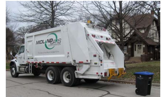
Midland Davis Corporation will collect the recycling carts.

For additional information, please contact the Public Works Department at 732-2200 or visit the city's website at www.rigov.org .